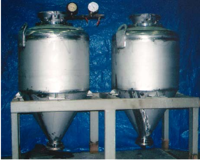
(Units on pressure test)