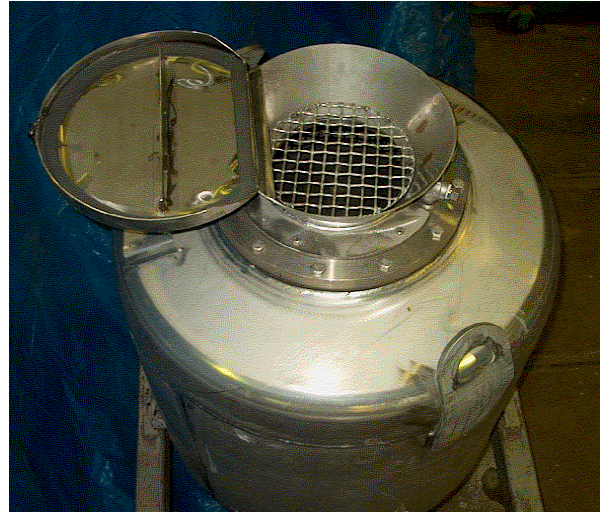
(View of loading funnel)

Baycar's 36" Ø AN-FO (Ammonium nitrate-fuel oil mixture) tank is available in various capacity ranges from 300Lbs to 2000 Lbs. of mixture. Capacities are based on achievable filling volumes. Now available up to 100 psig design pressure, with a typical operating range of 30 to 60psi. Our AN-FO tanks are constructed of non-magnetic, corrosion resistant stainless steel. Grades available are 304, 316 and 316L, depending on your environmental conditions.